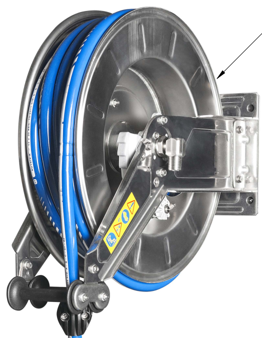
AUTOMATIC HOSE REEL cod. 00803000058

NITO SPRAY GUN : Working temperature : maximum 40°C Working pressure : maximum 6 Bar